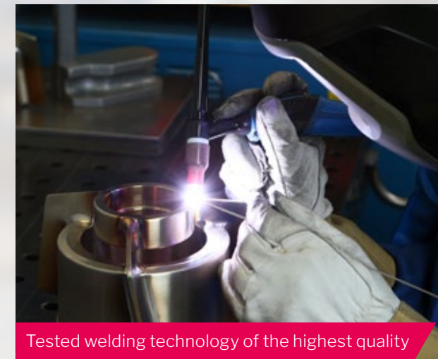
Tested welding technology of the highest quality

All the agitators we provide are freely configurable to ensure seamless integration into your processes. We can also offer special constructions designed for you by our own development department. As diverse as our agitators are, they all feature excellent materials and production quality, meet the highest specifications for aseptic design and of course comply with internationally recognised industry standards such as the FDA and GMP.