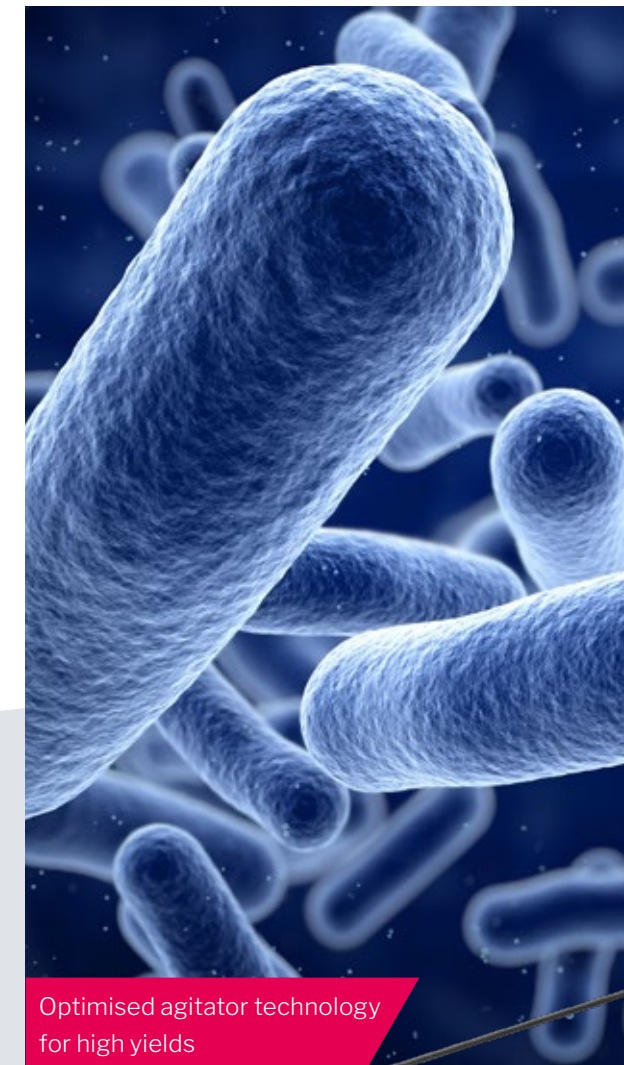
Optimised agitator technology for high yields

Agitators from PRG for the biotech industry: quality, precision and innovative capacity deliver sustainable optimisation for your biotechnological processes.