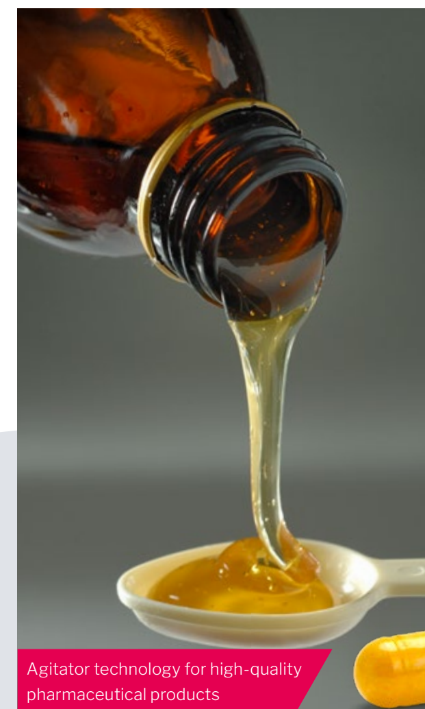
Agitator technology for high-quality pharmaceutical products

Design: exact, optimal selection and design of the agitator unit